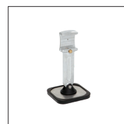
Single short foot Ref. 059320