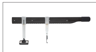
Single foot levelling bar premium Ref. 059290