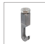
Hook 2 teeth Ref. 059382 HOOK 3 TEETH Ref. 059658