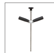
Central pulling rod Ref. 059399