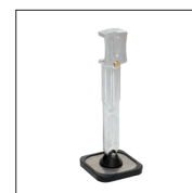
Single long foot Ref. 059337