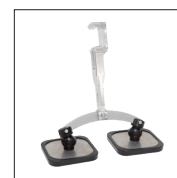
Double padded long foot Ref. 059368 Ref : 059375 (x2)