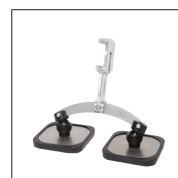
Double padded short foot Ref. 059344 Ref : 059351 (x2)