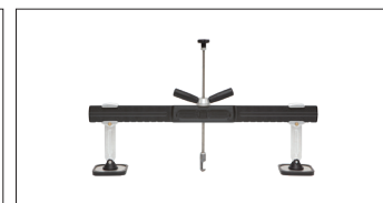
Premium levelling bar Ref. 059306