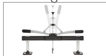
Premium levelling bar Ref. 058996